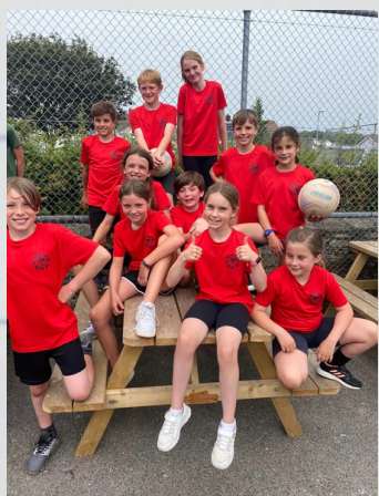
Team work making the dream work!