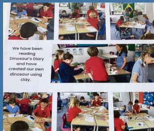
We have been reading Dinosaur's Diary and have created our own dinosaur using clay.

Year 3 have made a fantastic start to the new school year and the children have settled in really well. We started the new term by exploring the diary of a time travelling dinosaur. We discussed different types of dinosaurs and how paleontologists use lots of evidence to piece together what the dinosaurs looked like all those years ago. We designed our own dinosaurs and then used clay to model them and finally paint them.